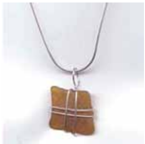
JSS1003 Sterling SeaGlass Necklace Drop $70.00