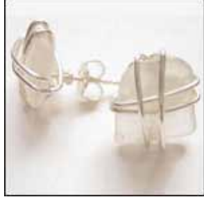
JSS1007 Sterling SeaGlass Stud Earrings $50.00