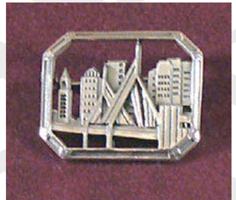
JAS2058, Zakim Bridge Pin, $45.00