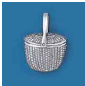
JAS1002 Nantucket Basket Brooch $30.00