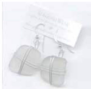
JSS1001 Sterling SeaGlass Earrings $60.00