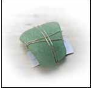
JSS1005 Sterling SeaGlass Broach $52.00