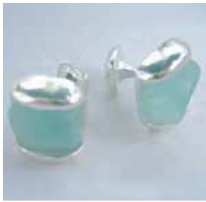
JSS1006 Sterling SeaGlass Cufflinks $98.00