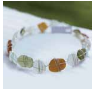
JSS1004 Sterling SeaGlass Necklace $200.00