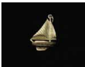
JAS1043 Sailboat Charm $22.50