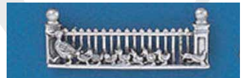
JAS1005, Boston Swan Boat Brooch, $34.00