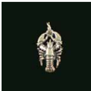
JAS1012 Lobster Charm $18.00