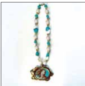
JBS2002 Art-to-Wear Necklace $50.00