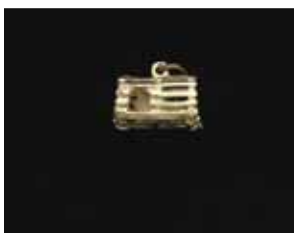
JAS1033 Lobster Trap Charm $25