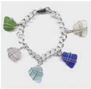
JSS1009 Sterling SeaGlass Charm Bracelet $120.00