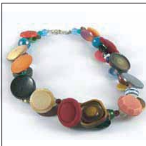
JBS1003 Art-to-Wear Button Necklace $58.00