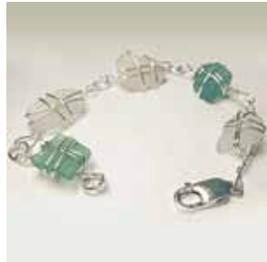
JSS1010 Sterling SeaGlass Chain Bracelet $120.00