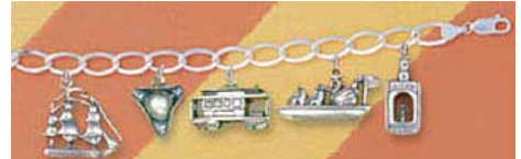
JAS1002, Boston Charm Bracelet, $159.00