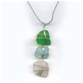
JSS1011 Sterling 3-Tiered Drop Necklace $120.00