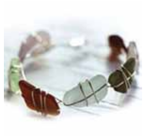
JSS1002 Sterling SeaGlass Bracelet $100.00